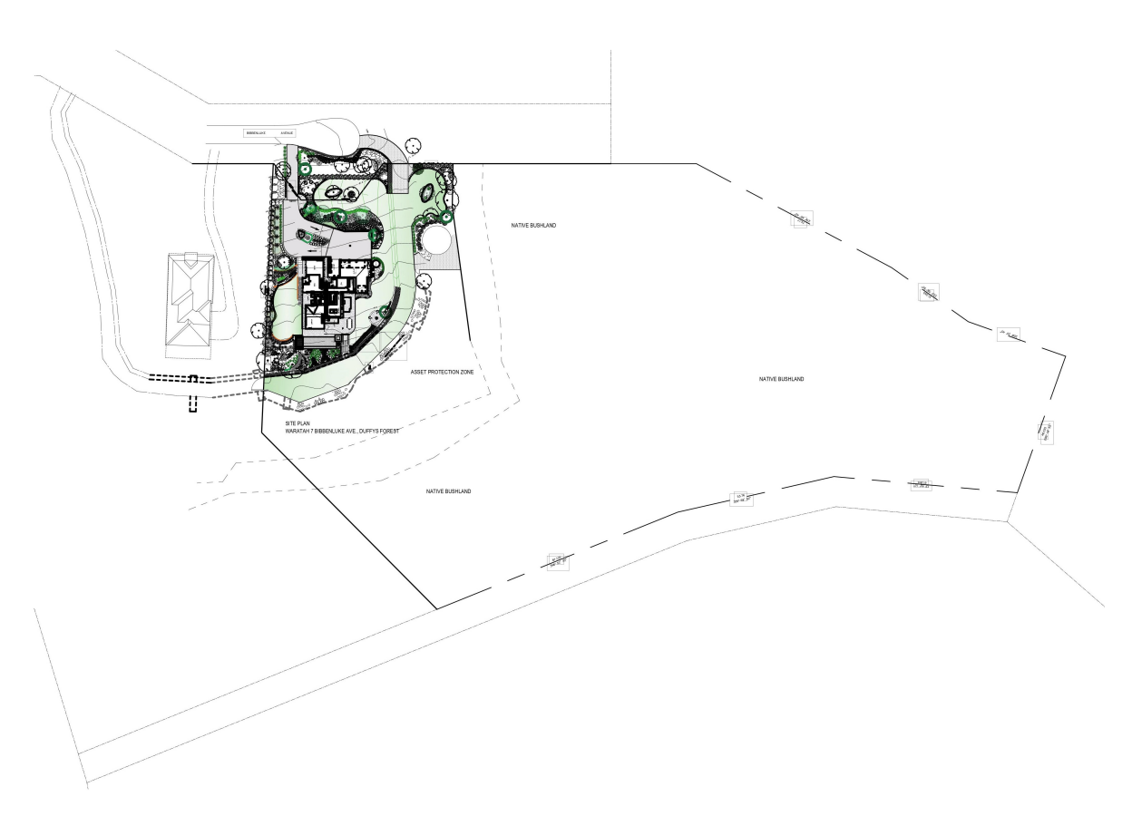
Scale in metres. Dimensions are approximate. All information contained herein is gathered from sources we believe to be reliable, however we cannot guarantee its accuracy and interested persons should rely on their own enquiries.