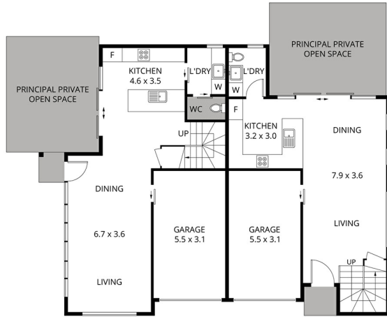
UNIT 1 - LOWER FLOOR