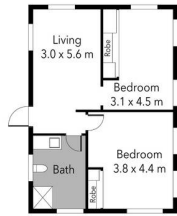
STUDIO / GUEST ACCOMODATION