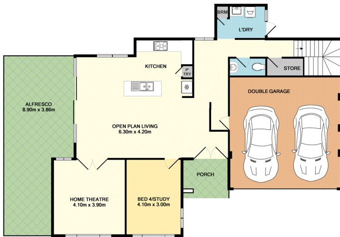
GROUND FLOOR APPROX. FLOOR AREA 130.4 SQ.M. (1404 SQ.F.T.)